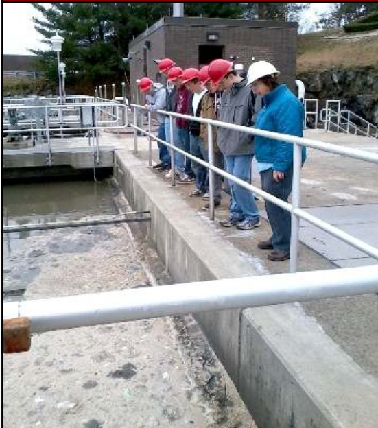
AP Environmental Science Students Tour the Millbury Sewerage Treatment Plant