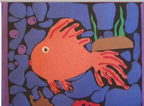
Theresa Sacs Grade 6