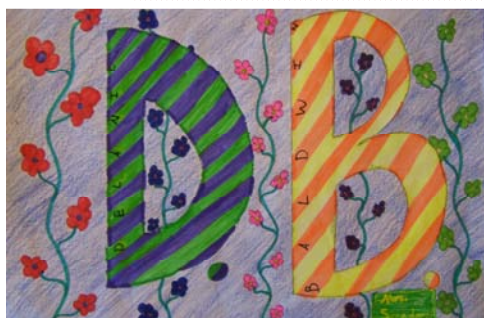
Delanie Baldwin Grade 5