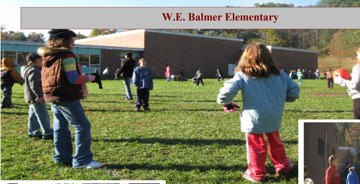
Balmer -International Field Day