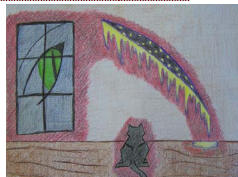
Celia Slater Grade 7