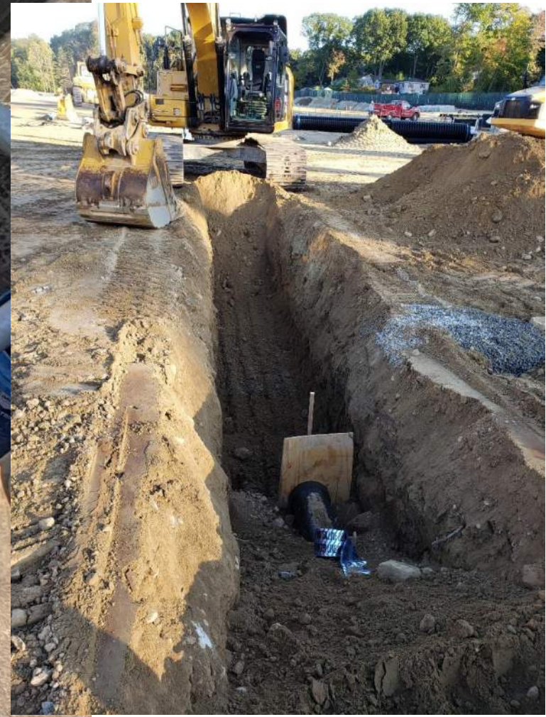
Connection of water line in Crescent Street