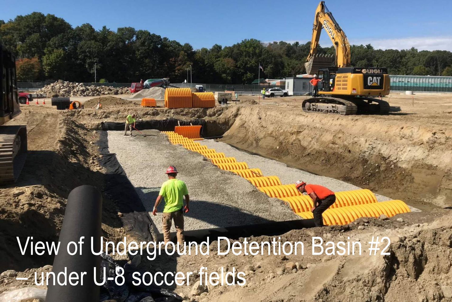
View of Underground Detention Basin #2 – under U-8 soccer fields