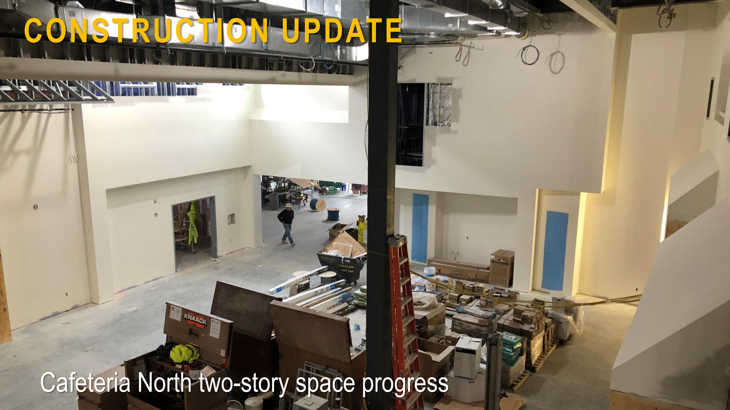
Cafeteria North two-story space progress