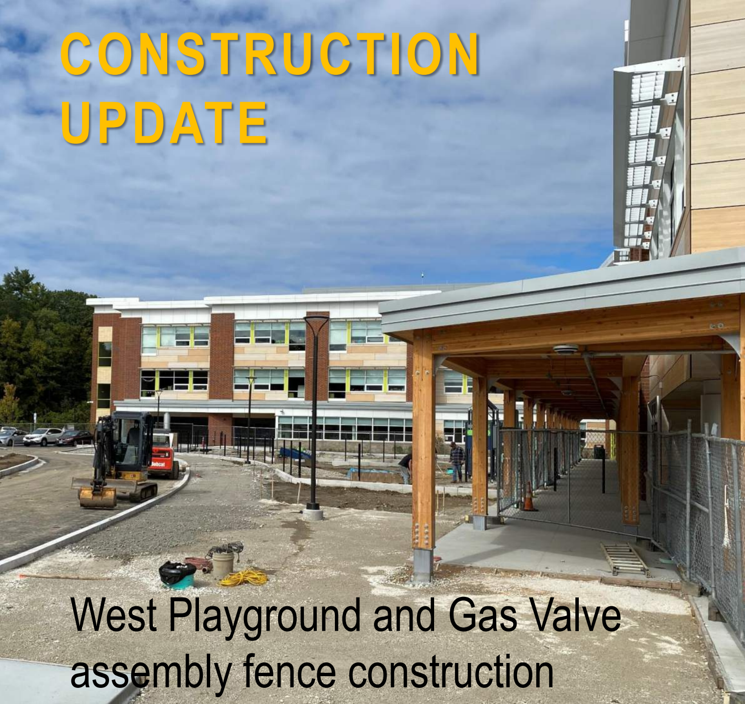
West Playground and Gas Valve assembly fence construction